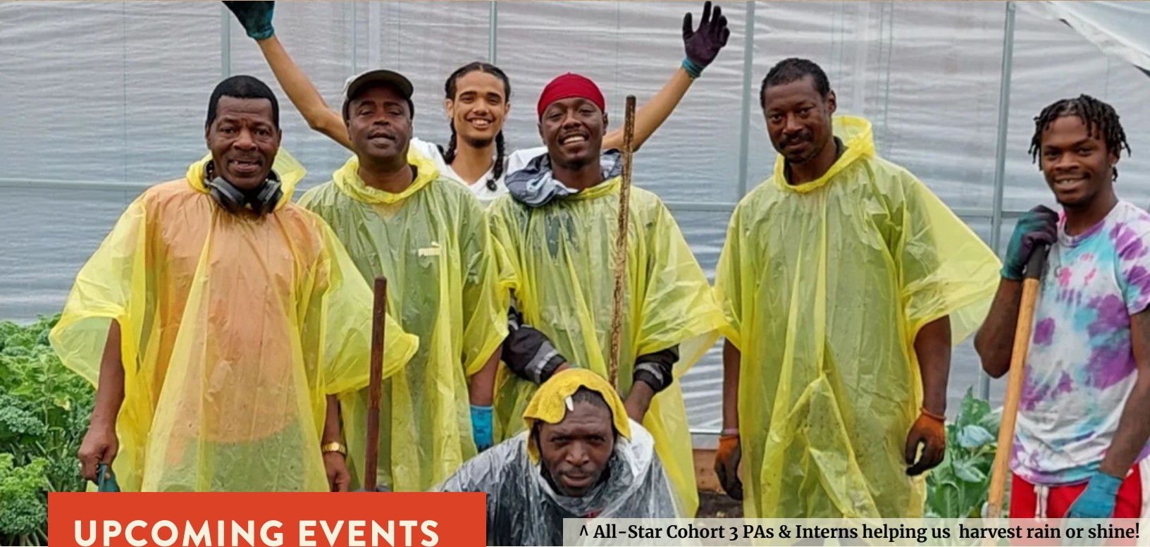
^ All-Star Cohort 3 PAs & Interns helping us harvest rain or shine!

SINCE 2002, GROWING HOME'S INNOVATIVE SOCIAL ENTERPRISE HAS USED URBAN FARMING TO TACKLE UNEMPLOYMENT & FOOD INSECURITY, RIGHT IN THE HEART OF ENGLEWOOD, CHICAGO.